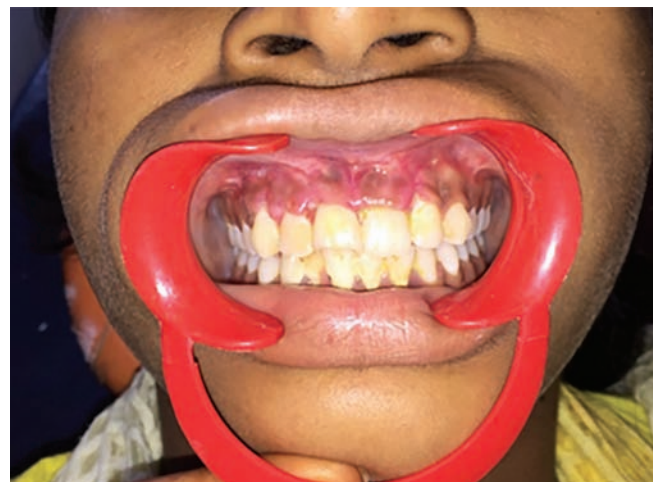
Fig. 1: Preoperative photograph of the child

Orthopantomogram revealed that the involved teeth had been reduced to half of the original root size of each tooth to approximately half its original length of ~10 mm (Fig. 2).