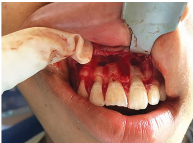
Fig. 3: Iatrogenic perforations of the labial cortical plate with large holes at the apical portion

The flap was sutured to its original position, and the patient was given postoperative instructions.