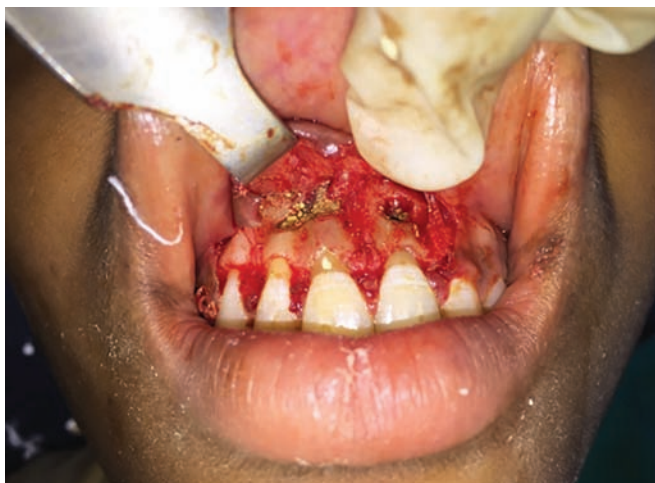
Fig. 5: MTA placed to seal the perforations