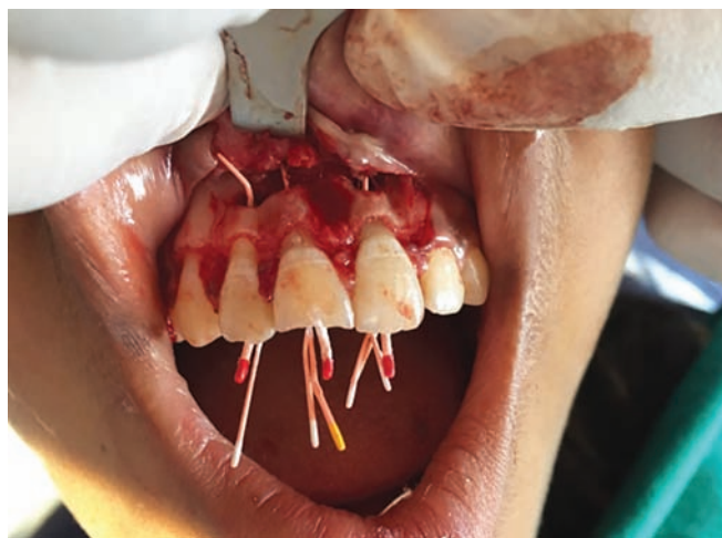
Fig. 4: After obturating the canals with gutta-percha