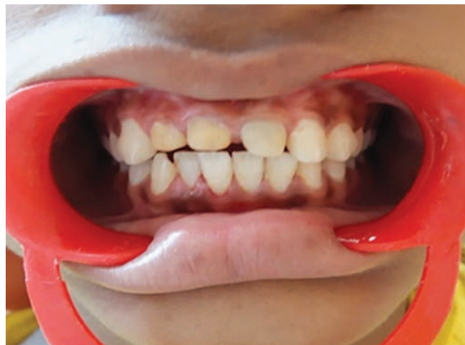
Fig. 6: Tooth preparation and shade selection