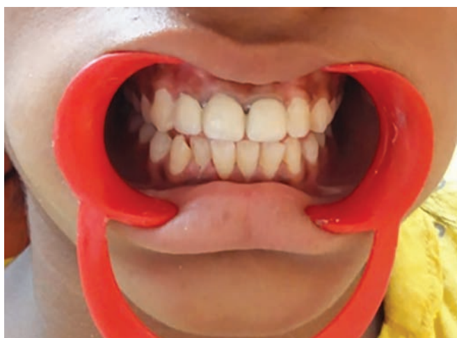
Fig. 7: Full veneer crowns given

The patient was recalled after a week, the sutures were removed, and no swelling, redness, or pain was seen.